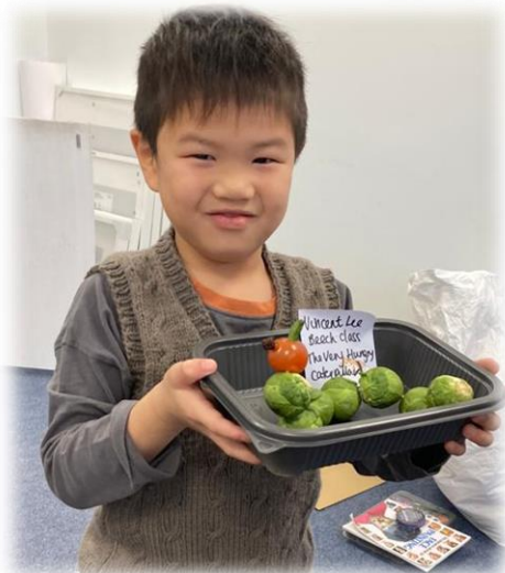
Creating a vegetable book character: Hungry Caterpillar