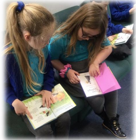
Reading buddies and using our library