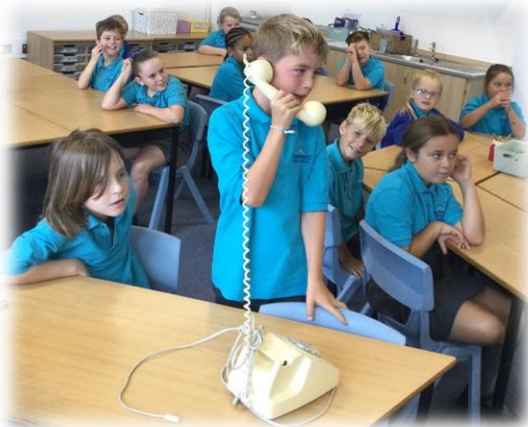
Role-play as part of having fun with poetry in Year 4