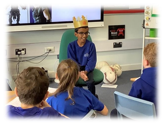
Roleplay to support Year 4 Writers!

Year 2 children investigating magnetism as Scientists.