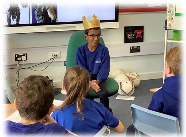
Roleplay to support Year 4 Writers!