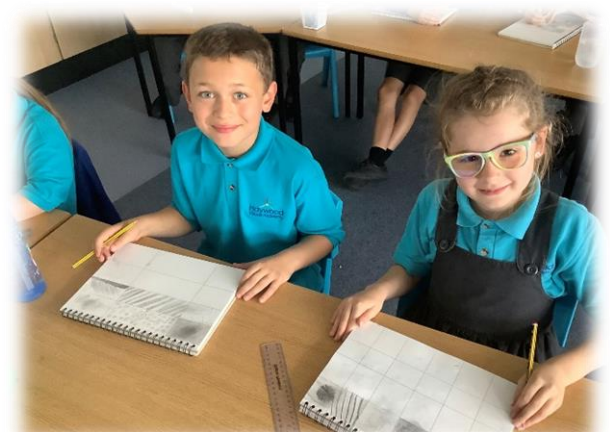
Enjoying fine drawing skills as Artists in Year 5!