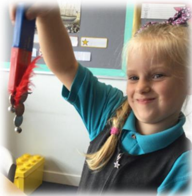
Year 2 children investigating magnetism as Scientists.