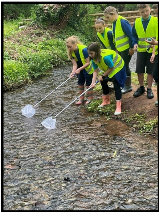
Year 5 geographers practically measuring river flow and having a chance to understand how rivers meander. Thank you to Wessex Water education team!