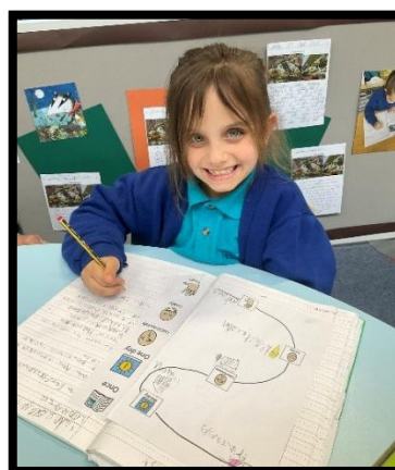
Year 2 writers have enjoyed creating their own losing tales and using resources to support them.