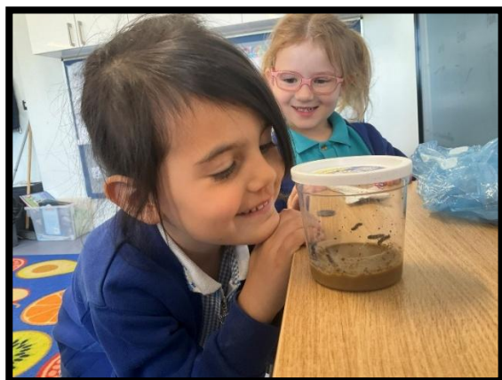
Pre-school Apple class have been keenly observing and monitoring the caterpillars in their class.

In the Learning: Here are some images from this week reflecting the experiences and opportunities that have supported children's learning this past week.