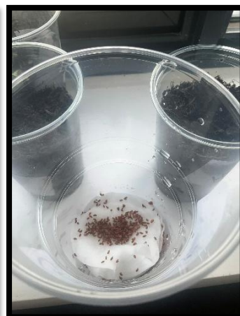
In Year 1 scientists prepared their experiment investigating the conditions to grow cress.