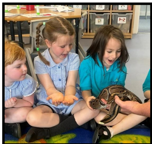
As part of their new theme of enquiry, Reception children had a visit from some Rainforest animals. They demonstrated curiosity and courage when asking interesting questions and holding the animals.