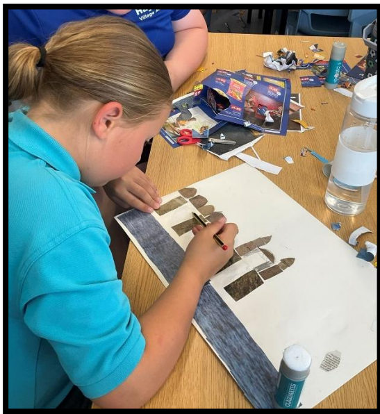
Year 4 artists have been focusing on line and shape within the discipline of collage as they created an image of our town's Grand Pier!