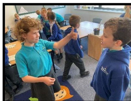
Year 3 have been practising their French speaking and listening, sharing their favourite foods.