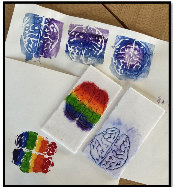
Year 6 artists have continued their printing this term and have created high-quality prints inspired by their science theme of enquiry on the human body.