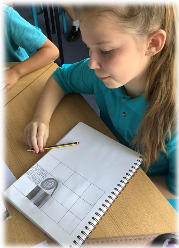
Year 5 artists have also been developing their pencil drawing skills.