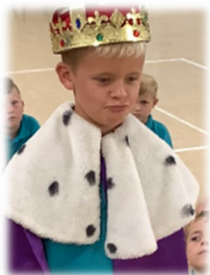
Year 4 were greeted by an Anglo-Saxon visitor to begin their learning as historians!