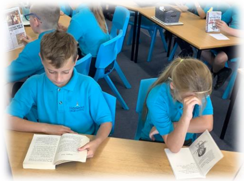
The Year 6 readers calmly settling down to read their reading book - Everybody Reading in Class (ERIC) - as they return from lunchtime.