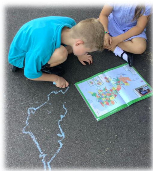
Year 3 geographers really looking at the counties of the south-west.