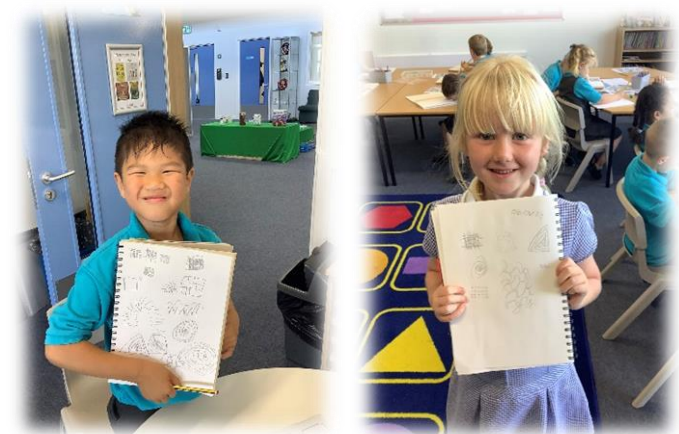
Year 2 artists also enjoying developing their drawing skills.