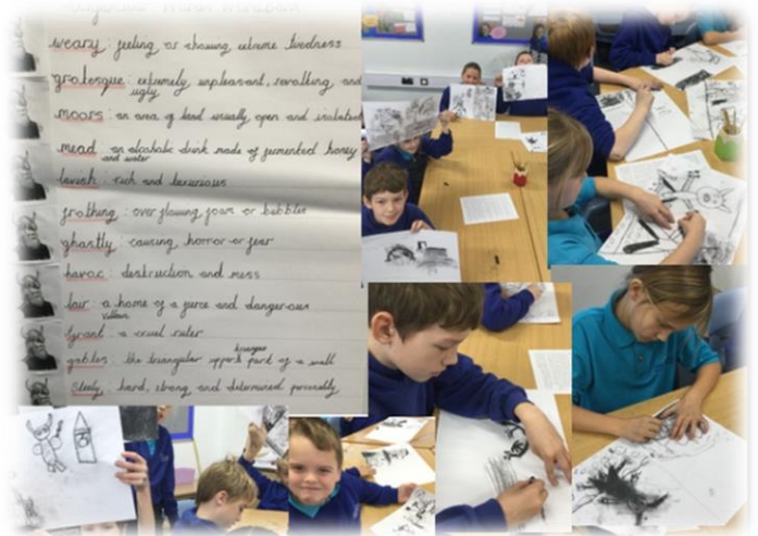
Year 4 writers exploring language as writers. They have been experimenting with charcoal within their learning as artists.