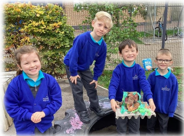
As a part of learning to be writers, Year 1 have been designing their own Bug Hotels! They planned these at the beginning of the week and have been bringing them to life throughout the week.