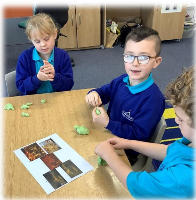
Year 2 artists are working with salt dough as part of developing their skills in sculpture.