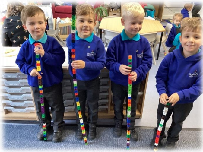
Reception mathematicians have been exploring height. They created their own towers out of cubes, then they compared them using the language 'tallest' 'shortest'.