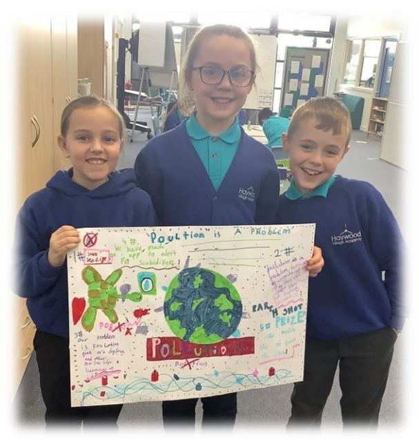
Year 4 scientists have been participating in the Earthshot prize. Our Earthshot focus for the week was: Can we fix our oceans? The children began by identifying a problem, then came up with ideas and solutions on how to solve it. They presented these to the group.