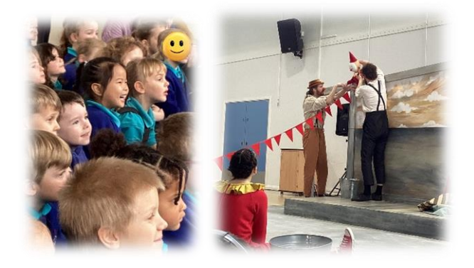
Reception children laughed and gasped at the performance of The Farmer and the Clown.