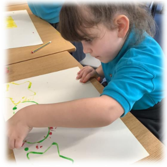
Year 1 artists learning how to print.