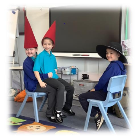
Year 3 writers revisited the story of The Farmer and the Clown and enjoyed their own role-play.

As citizens, Year 2 discussed what it means to feel relaxed and to feel stressed. They spoke about the importance of having time to relax in order for our minds and bodies to keep healthy. They were also developing their printing skills with mono-printing using tin foil.