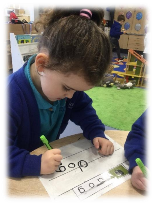
Some children in Pre-school Apple class have wanted to show us that they can write letters and words!

The school website captures some of the learning from this past week: