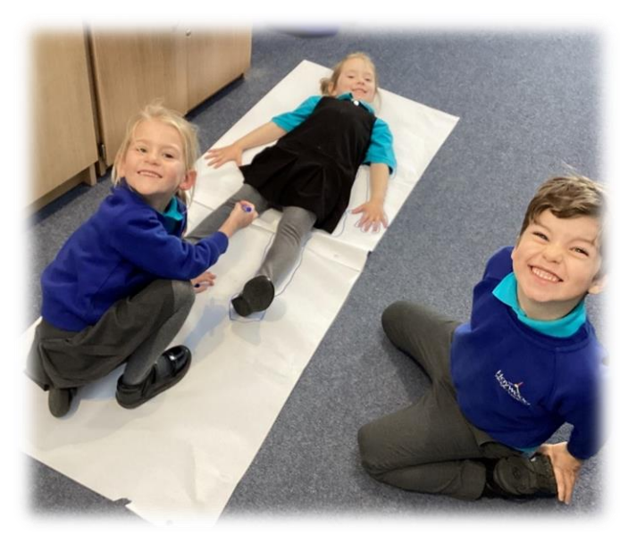
Year 1 scientists labelling body parts (after they draw around themselves!)