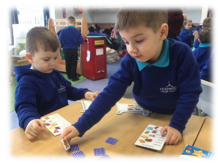
Pre-school have been practising their turn-taking skills and how to work as a team.

Lots of reading, writing and maths, but also so many other subjects and opportunities in school these past couple of weeks.