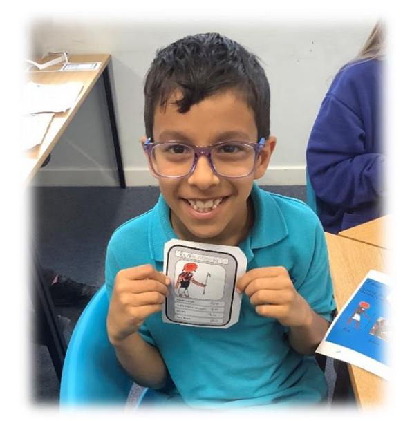
Year 5 historians creating 'Top Trumps' of their Egyptian gods.