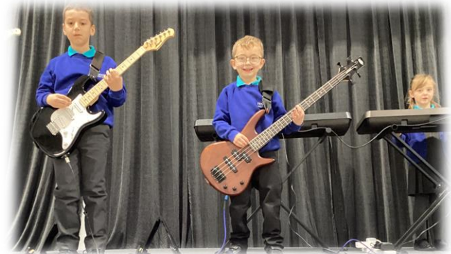
Year 2 musicians performing in their Rock Steady band.