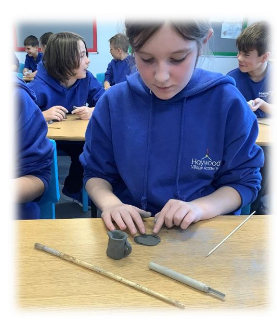
Year 6 artists mastering their clay modelling skills - coiling and pinching.