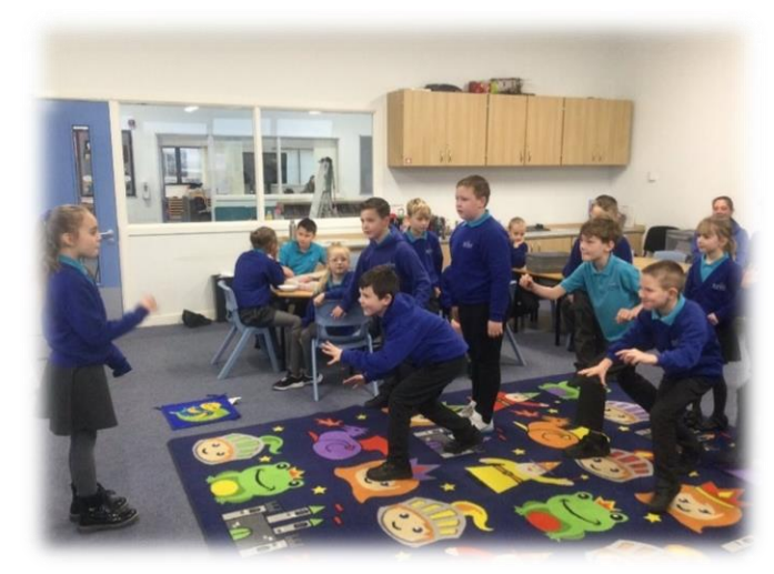
Year 3 in their 'Connect Us' time for PSHE playing 'Grandma's Footsteps' as explained to them by their Playleader.