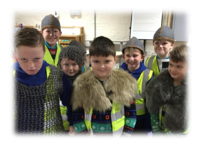
Year 4 enjoyed being curious at Weston Museum and taking part in a Viking workshop.