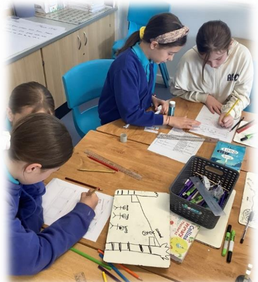
Year 6 computer scientists have been exploring stop motion animation this term. They have started to work on their storyboards ahead of creating their own projects.