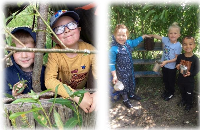
Reception children have enjoyed their Forest School lessons this week.