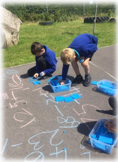
Year 3 have been learning their mathematics in the sunshine.