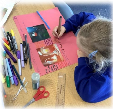
Year 4 designers began their electrical component theme of enquiry. They have been learning the process of designing and making their own bedside lamp. To begin this, they have discovered and evaluated existing products in the market for uniqueness, usability and target audience.