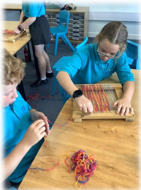
As designers, Year 5 have started to explore weaving as they work with textiles this term.