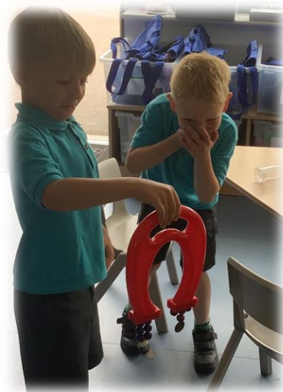
Year 1 scientists have been exploring magnetism.