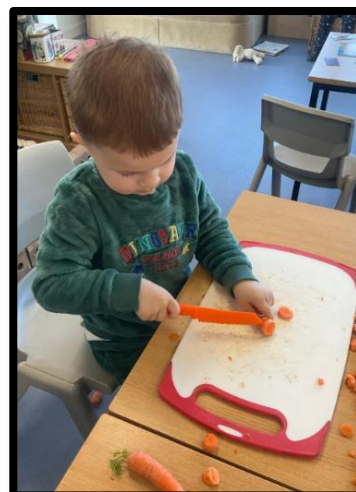
In Pre-school, Apple class have been improving their fine motor skills by cutting and chopping carrots as part of their learning.

In the Learning: Here are some images from the last two weeks reflecting the experiences and opportunities that have supported children's learning.