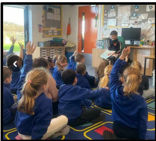
Year 2 writers have been enjoying role-playing and hot seating as their favourite characters from The Magic Paintbrush!