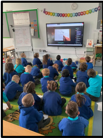
Year 1 had an exciting online assembly for World Book Week, learning how illustrators create and draw characters for the stories.