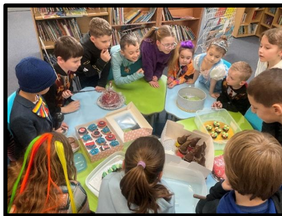
Children judging the 'Bake a book' competition