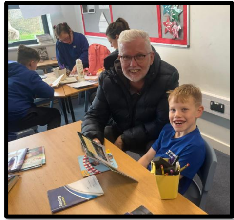
Along with other classes, Year 3 pupils had a great time with their parents, grandparents and carers in a whole-class open reading session!