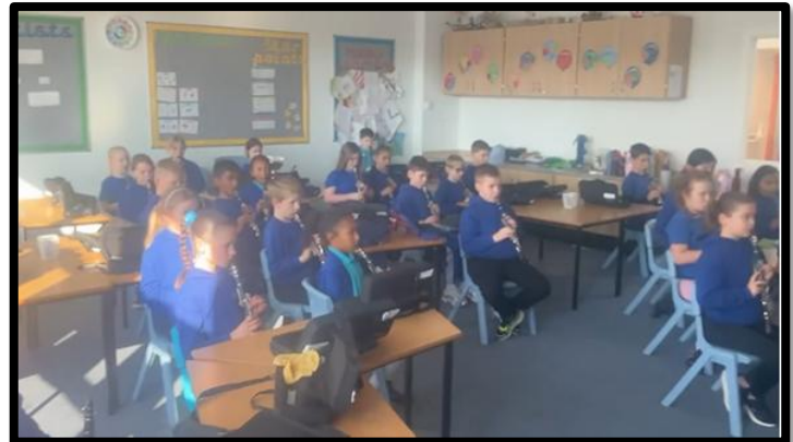
Year 4 are continuing to hone their skills as musicians, playing the clarinet with the help of North Somerset Music Service, WEMA.