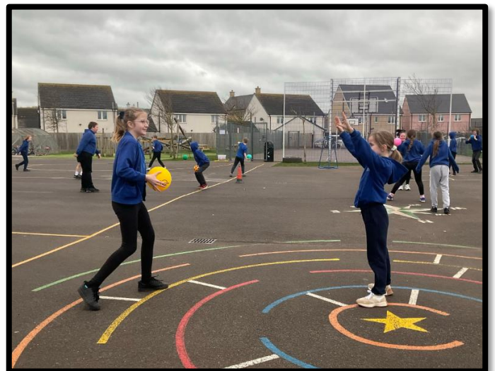
Year 5 scientists have been practising their ball skills as part of their PE lessons (outside, with no rain!)