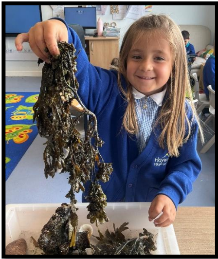
Reception finding out what the ocean is made of. They have been exploring seaweed, shells and our under the sea turf tray.