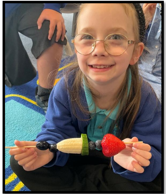
Year 2 scientists started their learning about healthy living by making fruit kebabs this week!