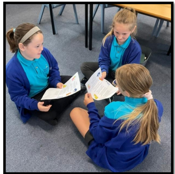
Year 4 writers have certainly had a fun-filled start to poetry week! They have painted a verse from the poem Cat Dreams, performed the poem with actions and generated ideas for an innovative poem in the same style!