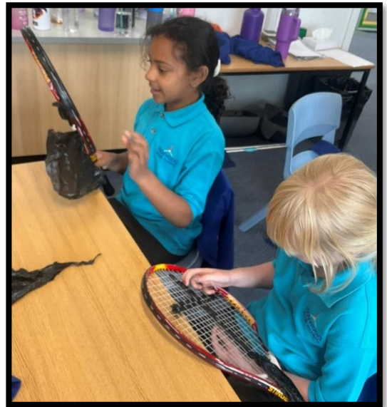
Year 3 artists are learning to weave and sew.