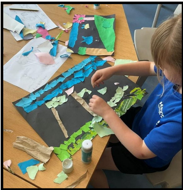
In Year 1, artists have been creating their final piece using the different techniques they have looked at in Term 5 to make their collages more effective. They made their final piece based on Henri Matisse and gardens.