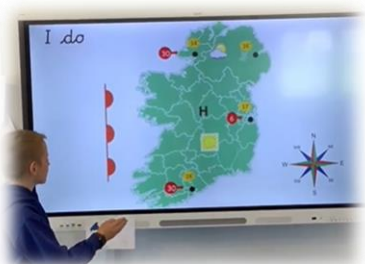
As meteorologists, Year 5 created and presented weather reports.