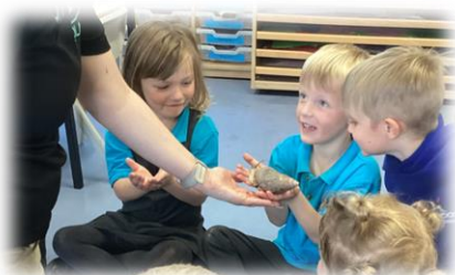
Reception children as scientists exploring rainforest animals.

https://haywoodvillageacademy.clf.uk/curriculum/year-1/