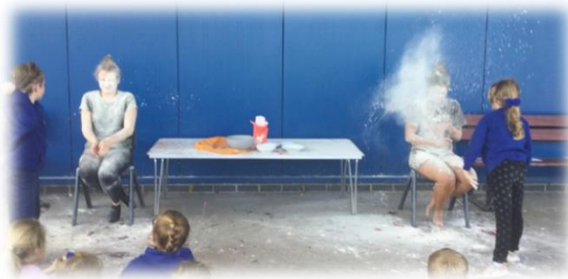
Year 2 Spelling Quiz saw a 'flouring' of teachers, when children won by spelling all their key words! Year 5 & 6 experienced similar opportunities recently.