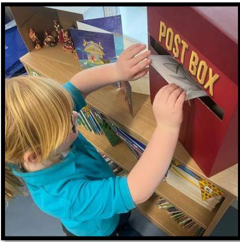
Year 1 have been Religiously Conscious and have been exploring themes of Christmas that are important to Christians.