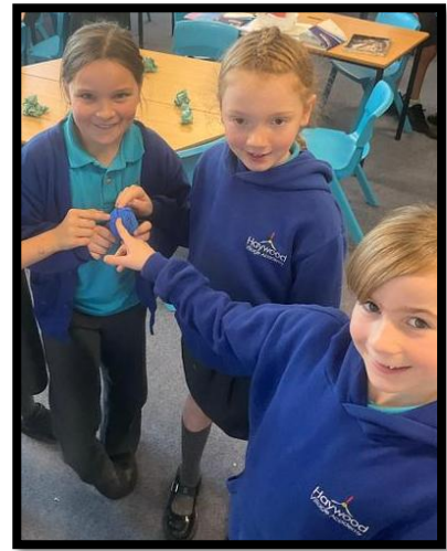
Year 5 Historians learnt about mummification. They had some fun when they mummified an orange!