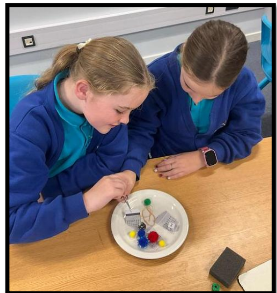
Year 6 scientists have been exploring adaptations. To do this, they looked at birds' beaks. They experimented with different objects to understand why some birds' beaks are a certain shape based on their diet. They then followed this up by looking at Charles Darwin's finch research.