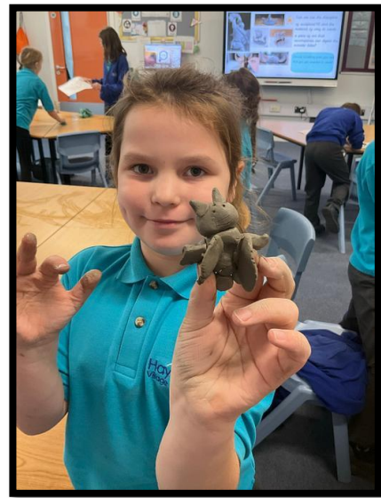
Year 4 artists have been learning how to make clay sculptures. They made clay models for their 'Defeat the Monster' stories.