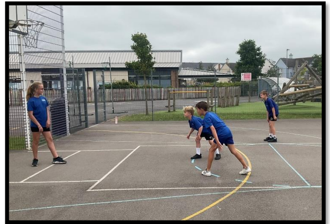
During PSHE, Year 5 revisited the HVA games playbook and played Grandma's footsteps. They then then wrote positive letters to their teenage-selves