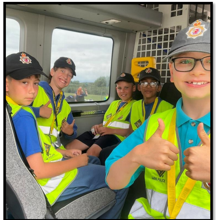
Year 6 have been on transition days to their secondary schools. Last week, Willow class enjoyed their penultimate mini-police session, which included looking inside a police van.