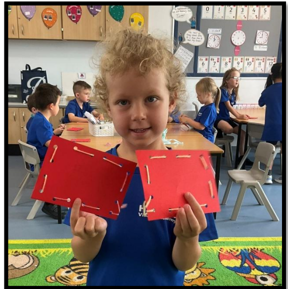
In Year 1, designers have been practising their skills working with textiles exploring weaving and sewing.