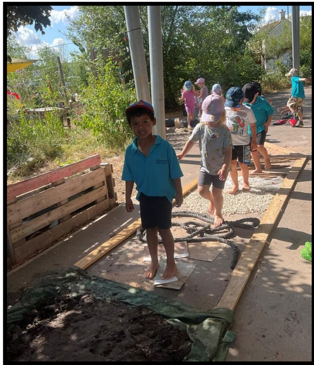
Pre-school Apple class enjoyed their time in forest school, on the sensory trail, feeling lots of different textures with their feet.

In the Learning: Here are some images from this week reflecting the experiences and opportunities that have supported children's learning this past week.