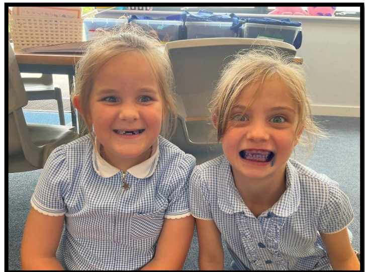
Year 2 scientists have been learning about keeping their teeth clean. They were interested to see the plaque on their teeth and are now determined to keep it away!