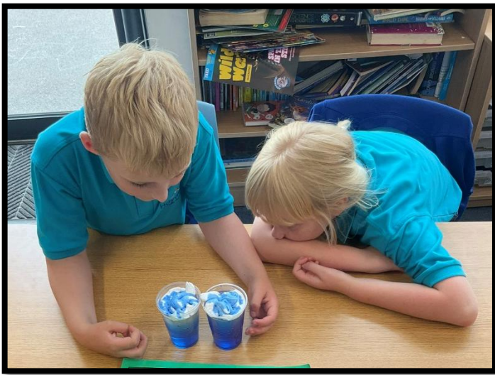
By simply using some water, shaving foam and some food colouring, Year 3 scientists demonstrated how precipitation falls from clouds to the ground.