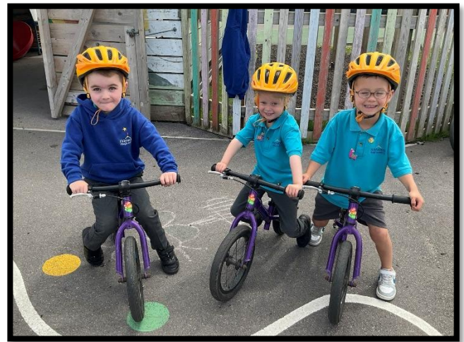
The Reception teaching team are really proud of the motivation and resilience shown during the children's bikeability sessions.

In the Learning: Here are some images from this week reflecting the experiences and opportunities that have supported children's learning this past week.