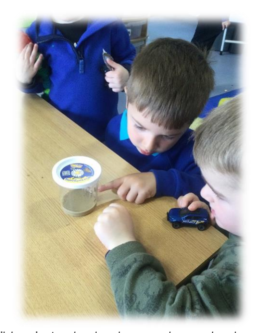
Children in Apple class have welcomed caterpillars into their classroom.

The school website captures some of the learning from this past week: