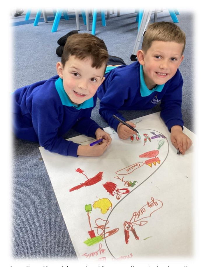
As writers, Year 1 have had fun creating stories together.