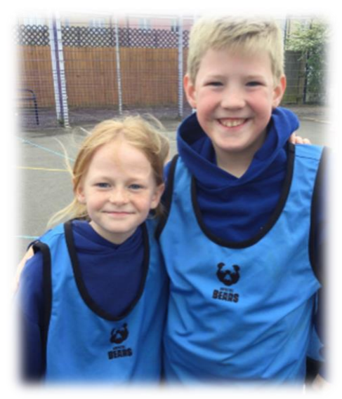
As sportspersons Year 4 have been enjoying the RISE programme led by Bristol Bears.