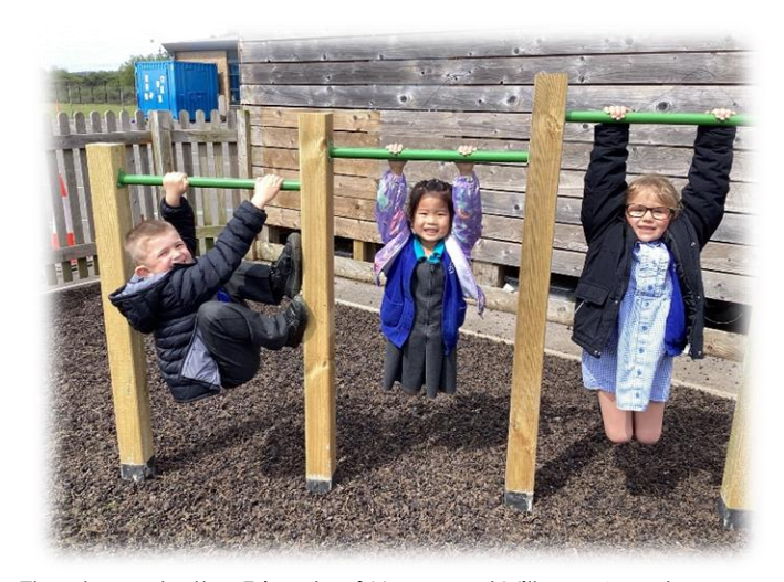
Thank you to the Friends of Haywood Village Academy, as our Reception have been enjoying their new hanging bars.