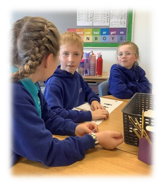
Year 3 citizens used their oracy and discussed different jobs at home and whether they were jobs for males, females or both. We also discussed stereotypes and what stereotypes we might have.