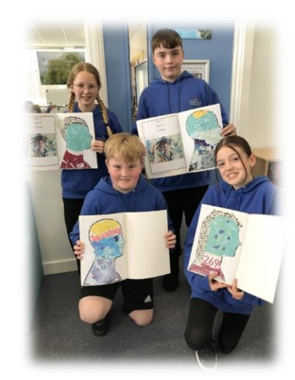
Year 6 artists have been creating collages of faces and have been considering the colour choices to represent feelings and textures for the face and hair.