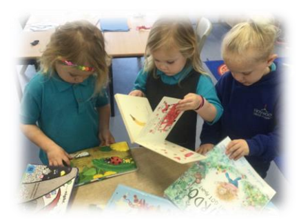
Pre-school had a visit from North Somerset Library Services and shared lots of new books.

Families can view learning experiences on the class pages on the school curriculum pages on the HVA webpage. Below is a snapshot of some of the action: