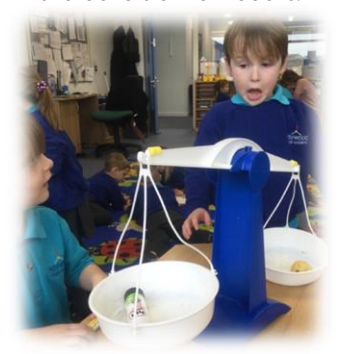
Reception mathematicians investigating mass using scales.