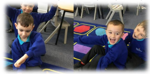
Year 2 freeze framing from our world book week inspired writing-'Hom'.