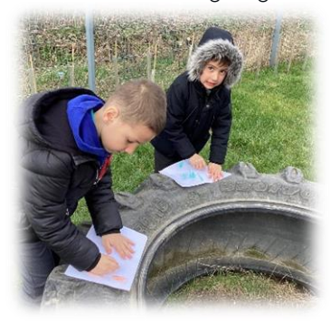
Year 1 artists learning about printing through rubbings.