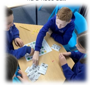
Year 6 mathematicians playing connect 4 bingo (with fractions) – competitive and fun!