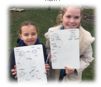
Year 3 scientists exploring insects in the school grounds.