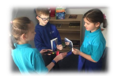
Year 4 scientists exploring how light travels.