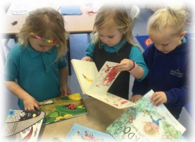
Pre-school had a visit from North Somerset Library Services and shared lots of new books.

Families can view learning experiences on the class pages on the school curriculum pages on the HVA webpage. Below is a snapshot of some of the action: