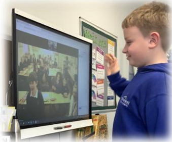
Year 5 citizens meeting and saying hello to their pen pals in Bristol via a video call.