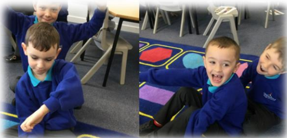
Year 2 freeze framing from our world book week inspired writing- 'Hom'.