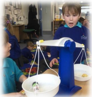
Reception mathematicians investigating mass using scales.