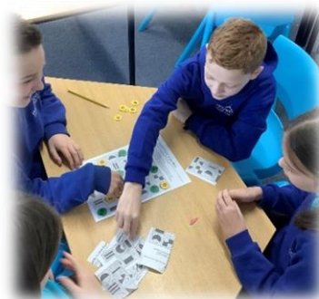
Year 6 mathematicians playing connect 4 bingo (with fractions) – competitive and fun!