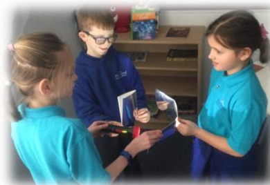
Year 4 scientists exploring how light travels.