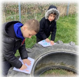
Year 1 artists learning about printing through rubbings.