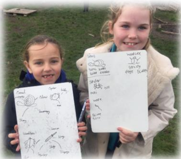
Year 3 scientists exploring insects in the school grounds.