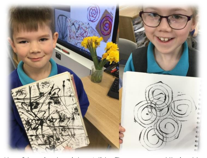
Year 2 learning to print as Artists. They even used their art to inspire their poetry writing.