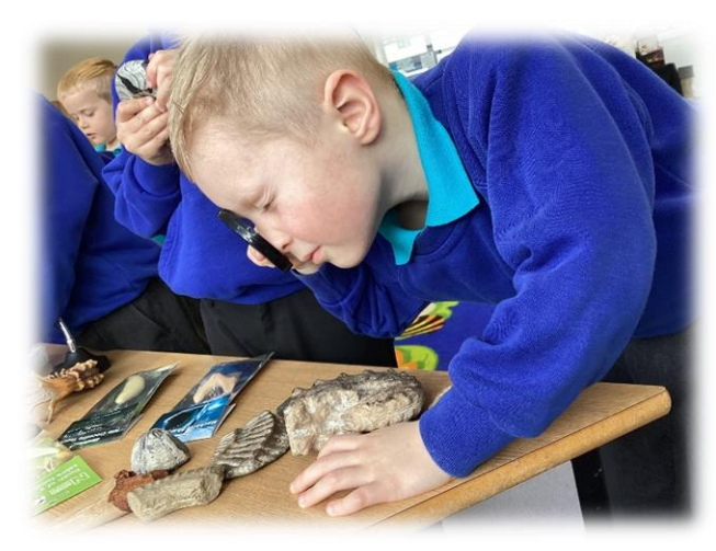
Reception Historians investigating fossils.