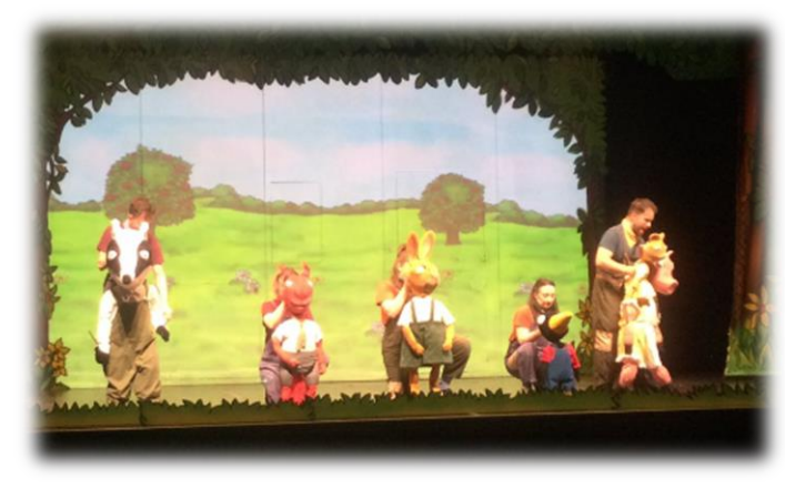
Pre-school had an amazing time watching Tales of Acorn Wood at the Playhouse! It was a super production! They loved hearing all the different stories.

Families can view learning experiences on the class pages on the school curriculum pages on the HVA webpage. Below is a snapshot of some of the action: