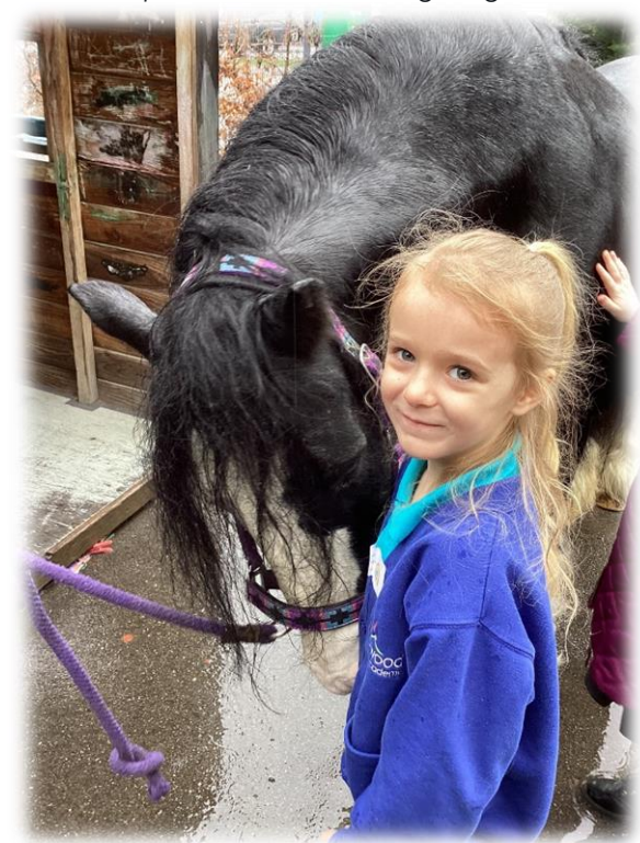
Year 1 Scientists have been learning about animals and how to care for them.