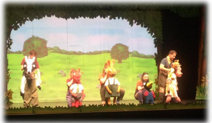
Pre-school had an amazing time watching Tales of Acorn Wood at the Playhouse! It was a super production! They loved hearing all the different stories.

Families can view learning experiences on the class pages on the school curriculum pages on the HVA webpage. Below is a snapshot of some of the action: