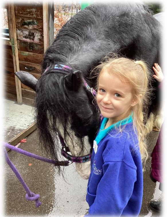
Year 1 Scientists have been learning about animals and how to care for them.