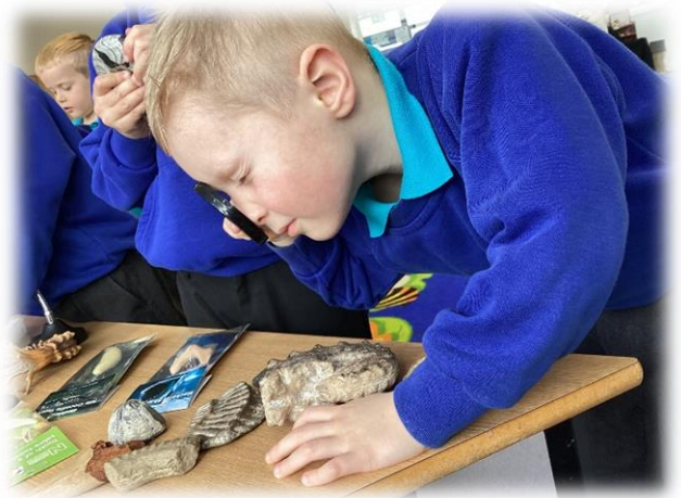
Reception Historians investigating fossils.