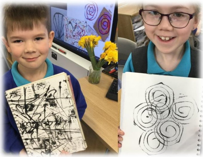
Year 2 learning to print as Artists. They even used their art to inspire their poetry writing.