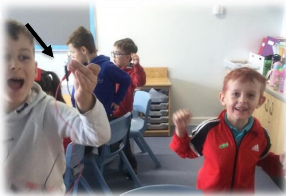
This is the moment scientists in Year 2 created light!