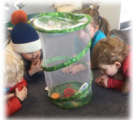
Our pre-school children are eagerly awaiting the changes of their caterpillars.