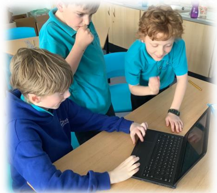
As computer scientists, these year 4 children are programming algorithms and debugging.