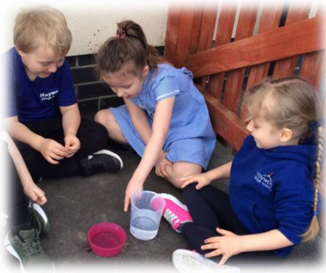
As mathematicians, Year 1 explored capacity.