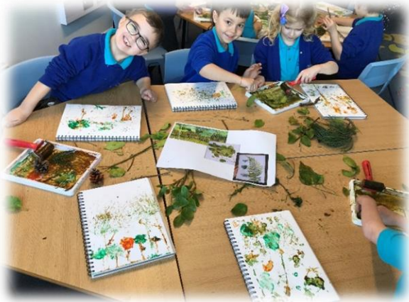
Year 2's enjoying printing using natural resources.

It has been great to have the children experiencing their in-school face to face lessons. Class web pages do show a highlight reel of learning opportunities, as will the twitter feed on the front of the HVA webpage. However, here are a few insights: