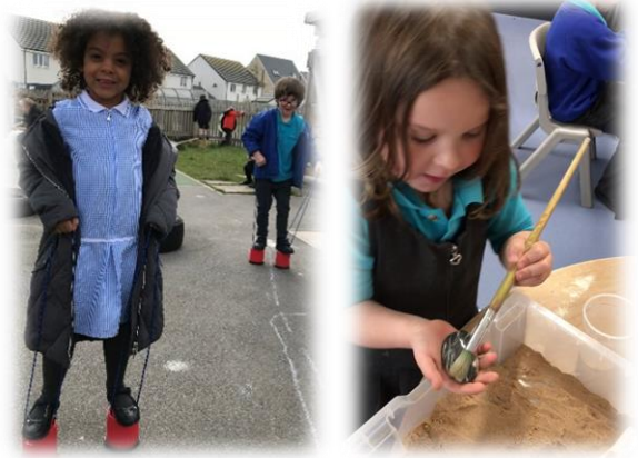
Reception children enjoying their outside space as they walk on stilts, whilst historians are discovering fossils!