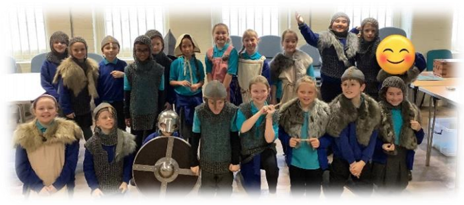
Weston Museum hosted our Year 4 historians for their recent trip to learn about Anglo Saxons and Vikings.