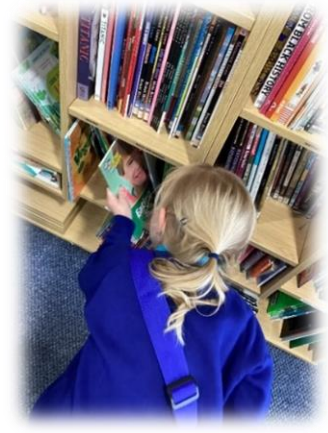
Reception children are enjoying our library – Thanks to the PTA for adding extra books!

Check out our school website and view the year group curriculum pages to view more images of learning in action.