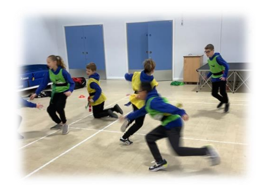
Year 6 Sportpersons enjoying tag rugby in our huge hall!