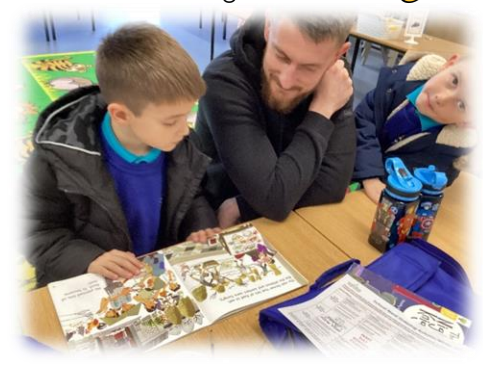
Great to see more parents using the school space at the end of the day to complete their child's daily reading.