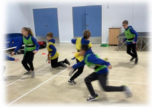
Year 6 Sportpersons enjoying tag rugby in our huge hall!