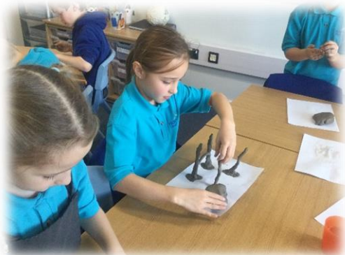
Clay sculpture by our Year 3 artists creating monuments and landmarks.