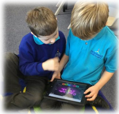
Mathematicians in Year 2 are practising their times tables at home using TT rockstars to practice their 2's, 5's and 10's.