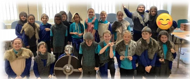
Weston Museum hosted our Year 4 historians for their recent trip to learn about Anglo Saxons and Vikings.