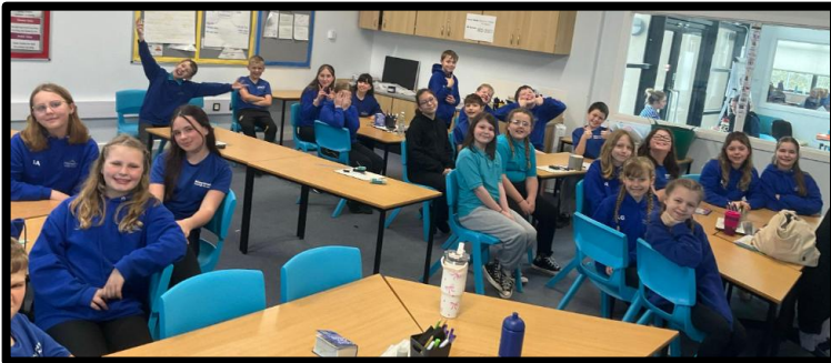
Year 6 have been debating (and writing about) different emotions families may have felt at the creation of the Berlin Wall after World War 2.