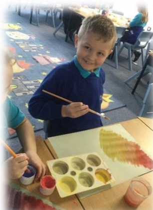
As artists, exploring painting and mixing colours

Thank you to all the parents that supported our staff by nominating our school on Facebook to receive a free takeaway from Pappadoms. The delicious free meal was a much-needed boost to staff.