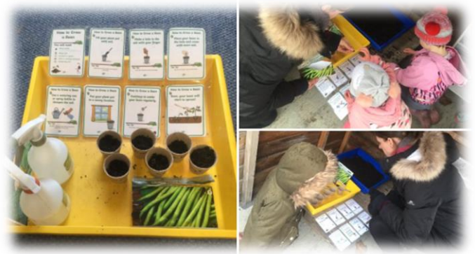
Learning to grow, as scientists, in Pre-school