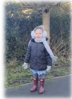
Reporting on the weather as geographers in Year 1