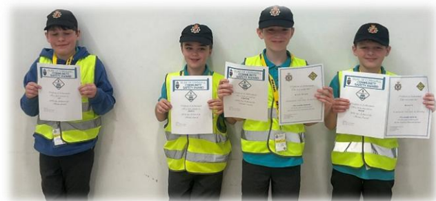
Year 6 Whitebeam class were able to share with parents their Mini-Police certificates having received these from our local PCSOs. They have worked hard to achieve these.