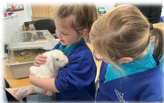
In Year 1 have been learning about animals this term and their Year 1 Pet Day was a wonderful success with children finding out about how to look after domestic or farm animals.