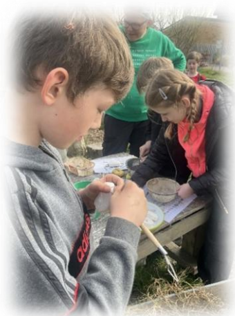
Year 4 enjoying Mayan inspired learning outdoors in Forest School! In this picture children have been creating Mayan stone (soap) carvings.