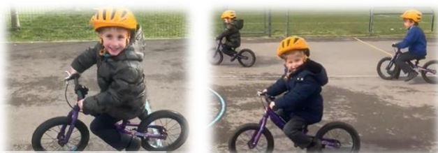
Reception have been improving their cycling skills through bikeability training.