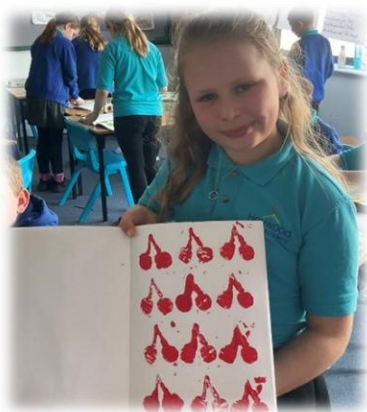
Year 5 artists created 'drop leaf' prints.