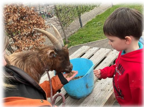
Pre-school Apple class had some surprise visitors on Monday. They enjoyed stroking Charlie the pony and feeding Harry the goat - he was very hungry.

In the Learning: Here are some images from this week reflecting the experiences and opportunities that have supported children's learning this past week.