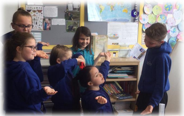
Year 3 Writers creating freeze frames to represent different parts of their wishing tale ~ The King of the Fishes