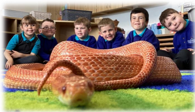
Reception children as Scientists – learning about animals and their tropical habitats – including this snake!