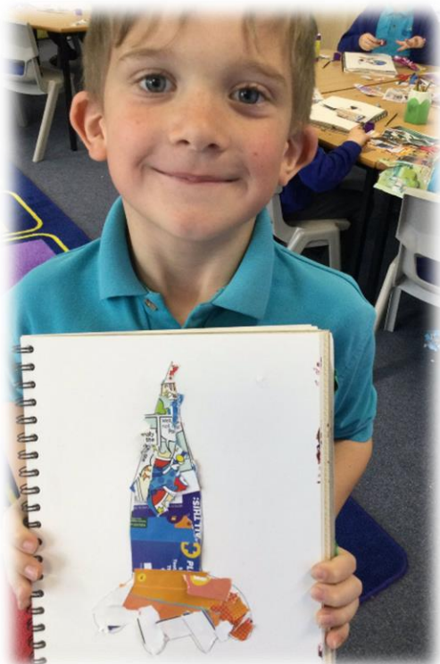
Year 2 Artists exploring collage and the skills to make their own pictures over the coming weeks.