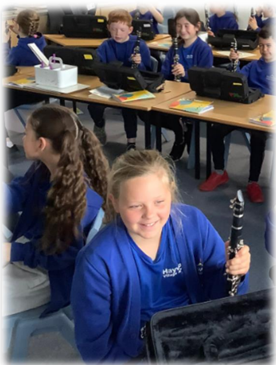
Year 4 Musicians have begun clarinet lessons. Lesson 1 was all about getting used to the instrument and how to assemble the clarinets.