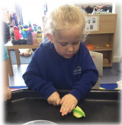
Pre-school children enjoying cutting their own fruit and eating it – inspired by the story Handa's Surprise .

You can view learning opportunities on our school website in the 'curriculum' section. Here are a few from this week: