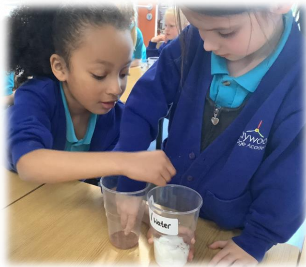
Year 1 Scientists at work - conducting an experiment with cress seeds and different growing conditions.