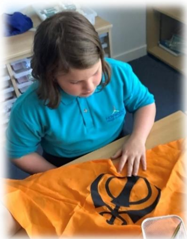
Year 5 children being religiously conscious and learning specifically about Sikhism and the symbols associated with the religion.