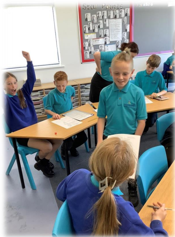
Year 6 learning spelling words through memorable games.