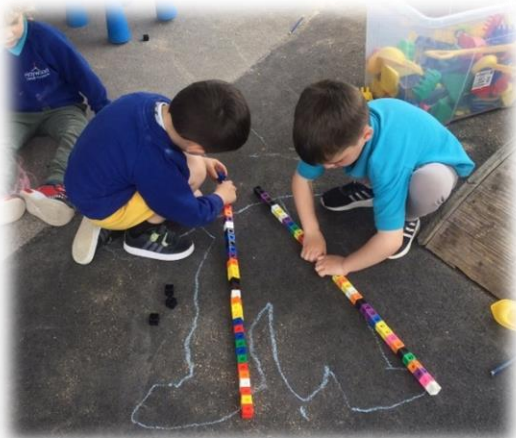
The Pre-school children in Apple class have been mathematicians – working together to measure their bodies.