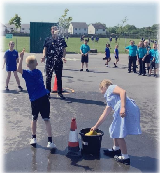
Year 4 children, having practised their spellings, enjoy the Great Spelling Quiz and soak their teachers!