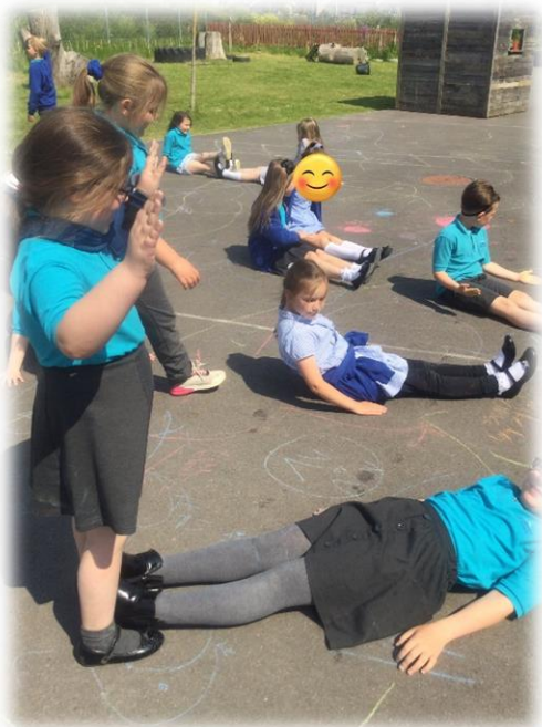
Year 3 mathematicians playing an angles game – with chalk, outside.