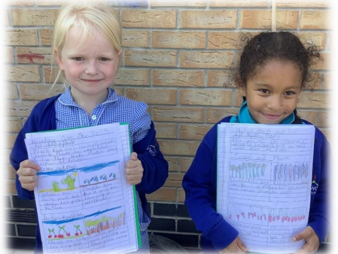
Year 1 scientific writers have created fact files about plants. They are so pleased with them and cannot wait to share them.