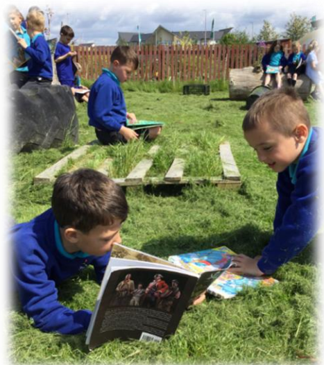
Year 2- Learning outside! Following a challenging week of quizzes Year 2 have enjoyed some reading time outside.