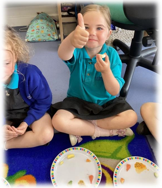
Reception were curious this week as they tasted fruits from the rainforest as part of their themed enquiry.