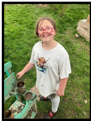
Year 5 returned to Forest School this term – potion making, playing and preparing to plant.