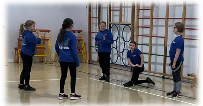
Each Friday, over the coming term, Year 6 are developing their confidence in dance with the Angels Academy coach alongside our teachers.