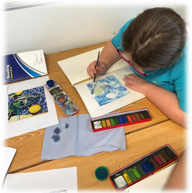
As artists and linguists, Year 5 been learning about Henri Matisse as they recreated some of his still life paintings using watercolour techniques