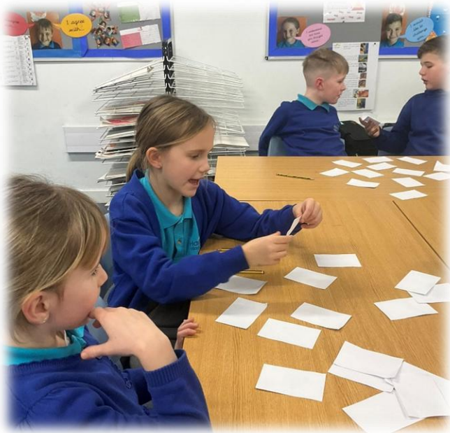
Year 4 linguists have learnt a tale about giants in French! They made links with their writer's tale and were able to match familiar English and French vocabulary.