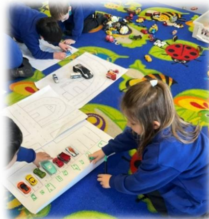
Reception enjoyed creating their own town and role-playing with cars and people. The children drew their own places, including the numbers on doors.