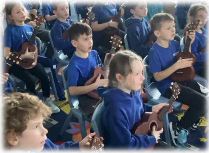
Year 3 musicians performed their ukelele skills to their parents.