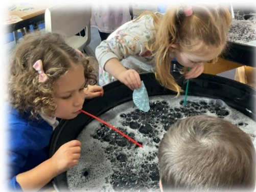
Pre-school learners in Apple class have explored cause and effect; they used straws to create bubbles and transport cake cases across the tray.

You can view each year group's webpage on our curriculum pages. You may use X to view the images from the classroom. Here are some insights to learning opportunities from the past few weeks: