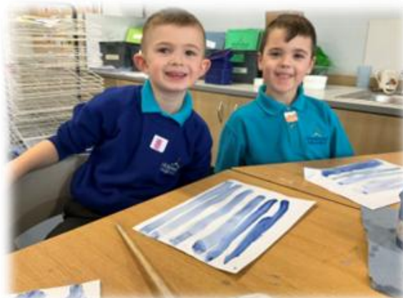
Year 1 artists have been developing their powder paint skills to vary their colours and tones.