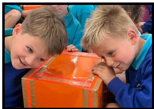
Reception had a really fun morning with the Fibbertigibbet Theatre! We laughed so much during their 'Babble' workshop. Thank you to the PTFA for subsidising this experience.