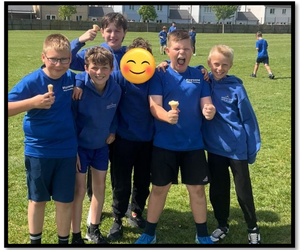
Year 6 are pleased to have completed their SATS. They have been superbly supported by parents and teachers. They look forward to their final term which will see them preparing for secondary school, whilst enjoying some traditional end of Year 6 opportunities including safety workshops, an end of year production, a trip to London and visiting their new schools.