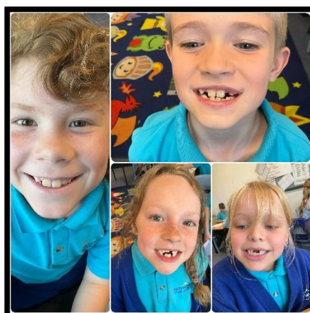
Year 3 scientists have recognised that in this year group, children tend to see their 'baby teeth' fall out. They have been learning about teeth and the different types of teeth they have.