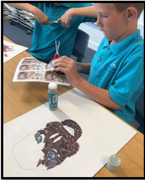
High-quality collage is evident in year 4. These artists can talk about their art and create impressive images.