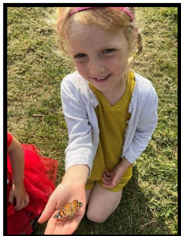
Pre-school Apple class released their butterflies this week – how amazing for them to have experienced and observed the lifecycle of this insect?

In the Learning: Here are some images from this week reflecting the experiences and opportunities that have supported children's learning this past week.