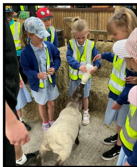
Year 2 learners had an excellent trip to Court Farm last week. This is a great experience with school starting and ending at the farm. Thank you to parents for supporting this trip so positively.