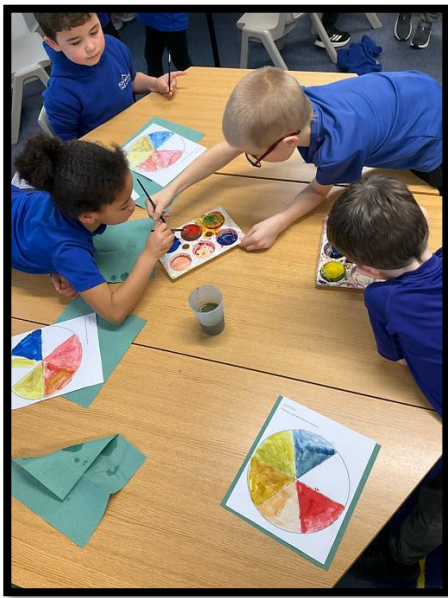
Year 2 have been exploring the colour wheel and how to colour secondary colours.