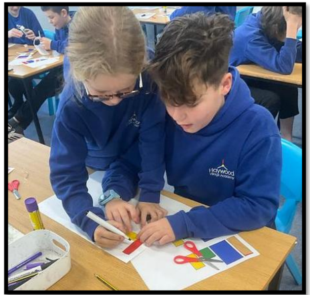
Year 5 mathematicians have been exploring.