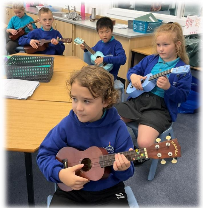
Year 3 have been learning the ukelele: This week they learnt about the C string, and we played along to 'A Sailor went to Sea.