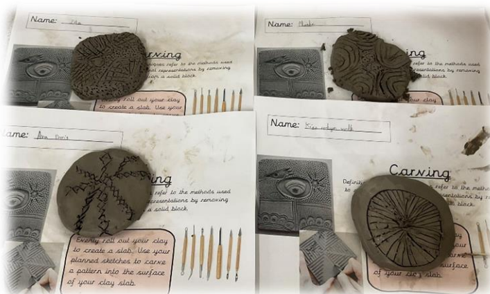
Year 4 artists have been developing sculpture skills and made clay slabs with Viking patterns.