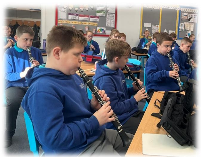
Year 6 musicians have continued to learn how to play the clarinet.