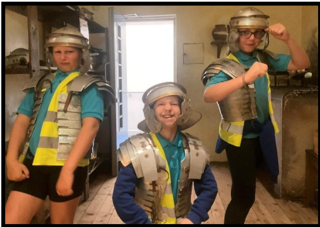
Year 5 historians learnt Roman drills, explored artefacts and explored real-life ruins. They had a great day at Caerleon!