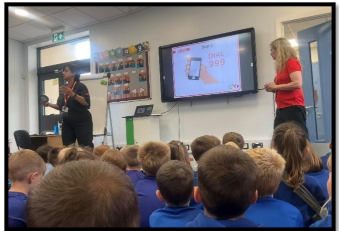
Year 1 joined an assembly presented by Avon & Somerset Fire Service on how to stay safe this summer.

In the Learning: Here are some images from this week reflecting the experiences and opportunities that have supported children's learning this past week.