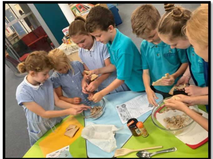
In Year 3 it was Tudor Day! They started by recreating portraits of Henry VIII. They created Tudor meals as they made their own Tudor pottage and gingered bread.