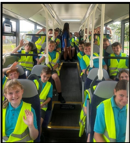
Year 6 learnt how to catch a bus! They had a trip on the new electric buses and even visited the depot to see what happens to our buses when they park up for the night.