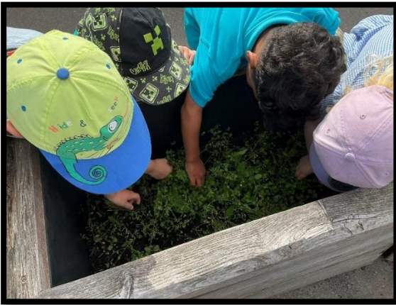
Pre-school Apple class harvested the peas and carrots that they grew this term. The pea plant is really healthy and we are hoping there will be some peas for the children to discover next term.

In the Learning: Here are some images from this week reflecting the experiences and opportunities that have supported children's learning this past week.