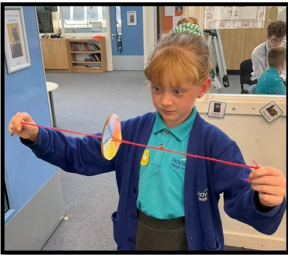
Year 4 scientists had fun making Newton Wheels and learning about the colour spectrum. You can watch this in action

https://x.com/HvaMulberry/status/1944754469360611514/video/1