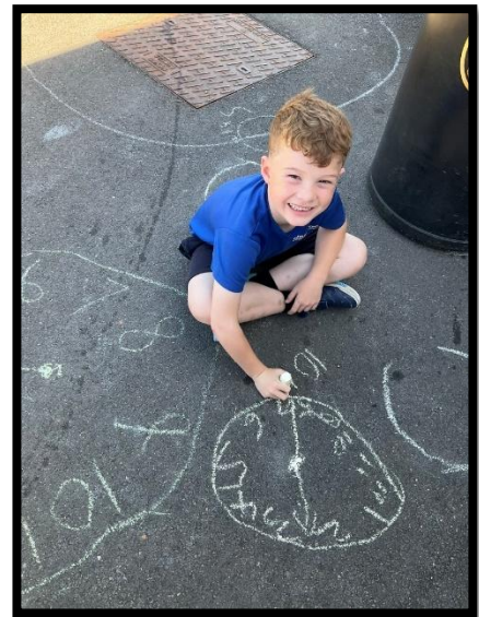
Year 2 mathematicians have learnt to tell the time to 5 minutes past or to the hour.