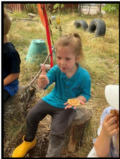
Reception enjoyed their Forest School sessions – they made pancakes.