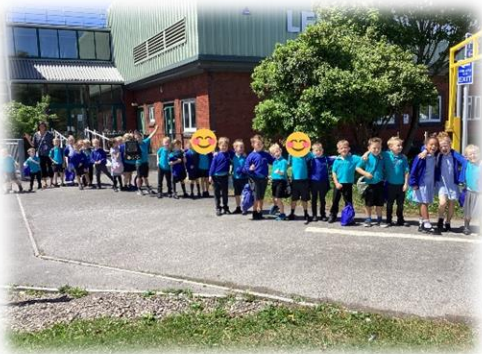
Year 1 have been resilient swimmers this term!

Today we said 'bye, for now' to our Year 6 children. 10 of the children were from a newly created Year 1 class in April 2017. Over time, the class has grown to 30 unique and wonderful children. Last week, they performed their end of year production, which was a tremendous success. They have worked hard and are now ready for secondary school. We wish them all the best and look forward to them returning at times to 'say hello' and sharing with us how they are getting on.