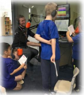
Year 2 making links to Scientists in reading and writing for the radio audience.