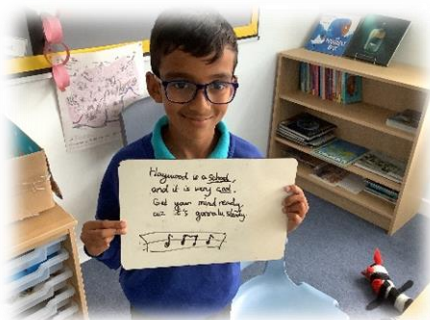
Year 3 Musicians creating raps.