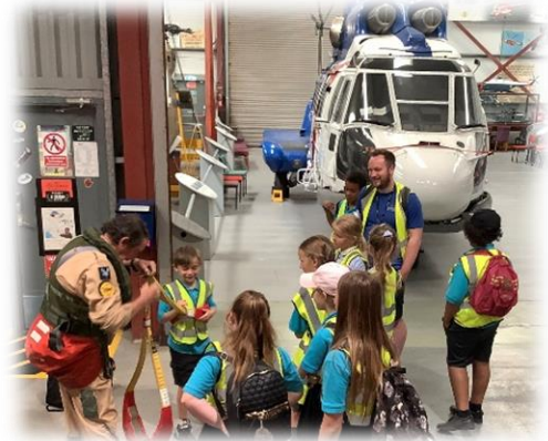
Year 5 local Geographers and Historians visited the Helicopter Museum.