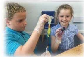
Year 4 Designers enjoyed dyeing fabrics