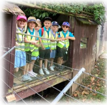
Reception children exploring Bristol Zoo as Scientists, Geographers, and responsible young learners.