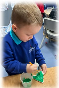
Pre-school Apple artists: modelling, creating and painting with salt dough.

You can look on the curriculum pages of the school website to see what the children have been learning these past few weeks.