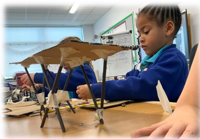
Year 1 designers redesigned a new Birnbeck Pier. They discovered what would make a strong structure and planned their designs.