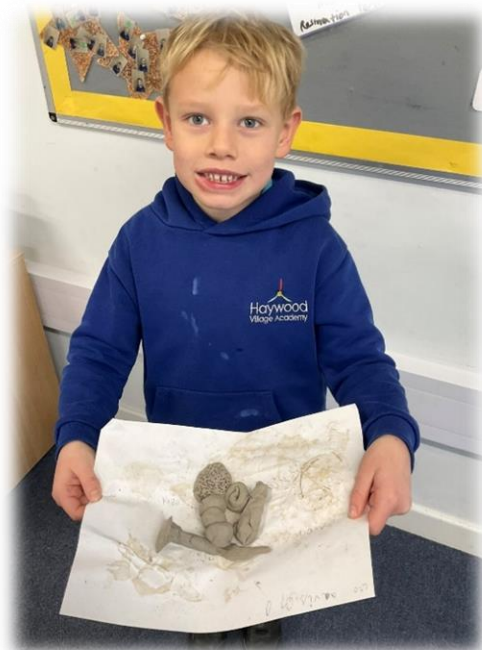
Year 2 artists creating their bread sculptures – using all their techniques to create various shapes and textures.