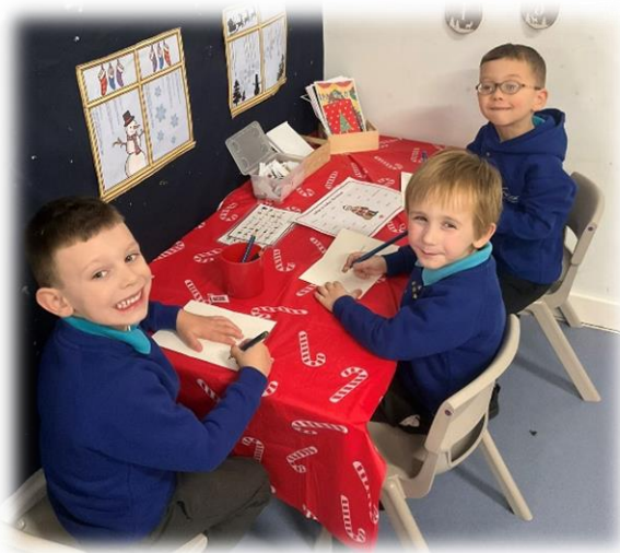
Reception children have been writing cards and messages to their friends and families.