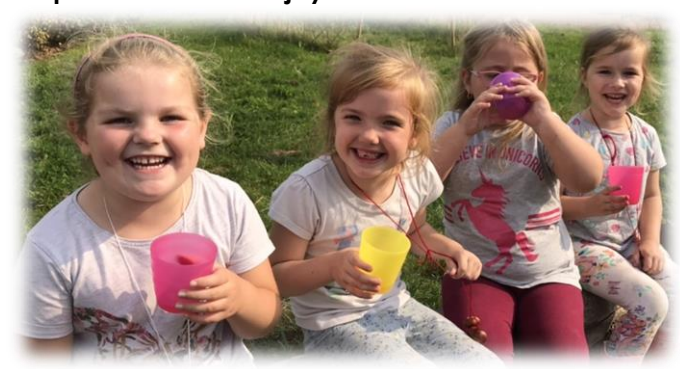
Year 1 making fresh apple juice in Forest School