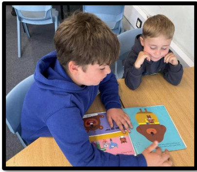
Year 3 being great role models as reading buddies this week.