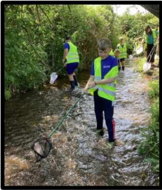
Year 5 enjoyed a great trip to Wessex Water this week!