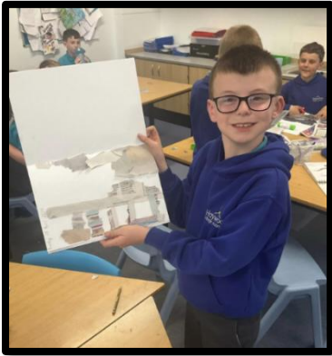
As artists, Year 4 have created some fabulous collages of buildings and weather in our local area.