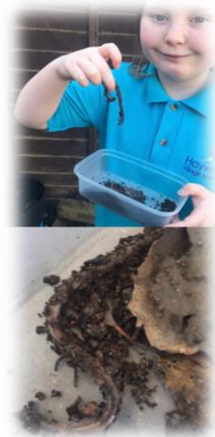
Year 3 exploring insects, as scientists, in the Forest School area and at home.