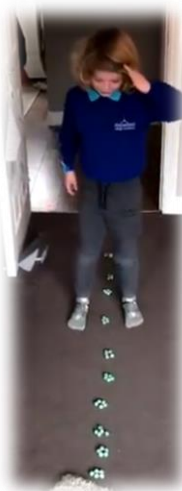
Year 1 counting in fives with objects as mathematicians