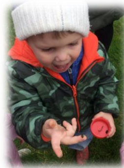
Inspired by the Very Hungry Caterpillar story, Pre-school also searched for insects around school.