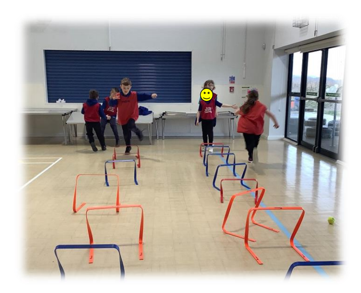
Year 5 athletes developing their speed and agility.