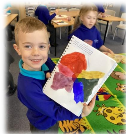
Year 1 artists mixing secondary colours.