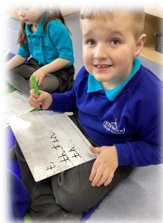
Reception learning to write.