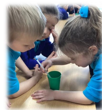
Year 1 scientists learning to measure temperature.

Year 2 in singing practice. They usually practise with others in the hall but not recently, due to class bubbles. You can watch this on the Elm class page.