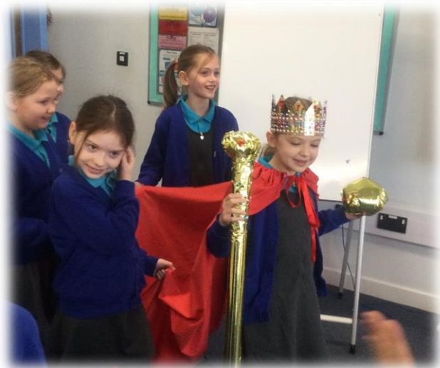
Year 3 exploring the coronation ceremony of Queen Elizabeth II.