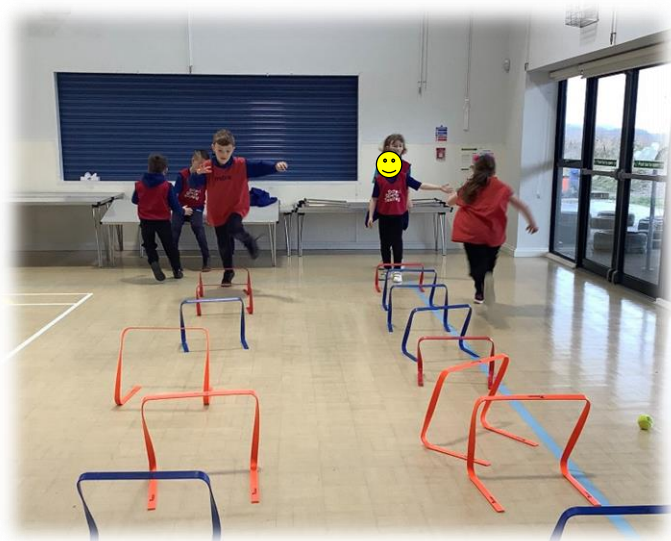
Year 5 athletes developing their speed and agility.

Children in Reception and Year 1 can access Numbots. https://play.numbots.com/#/intro All the logins have been given out on reading records or can be requested.