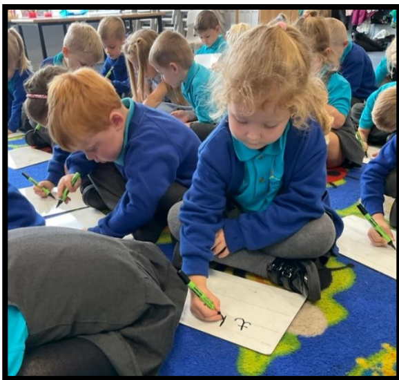
Reception children are already learning their sounds and writing the letters that match the sounds!

In the Learning: Here are some images from this week reflecting the experiences and opportunities that have supported children's learning this past week.