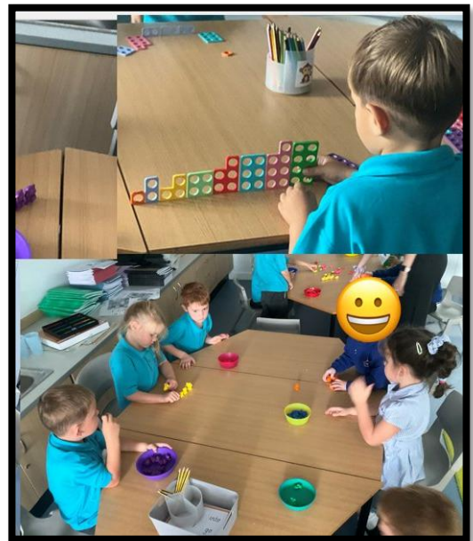
Year 1 mathematicians have been sorting shapes and numbers – great reasoning.