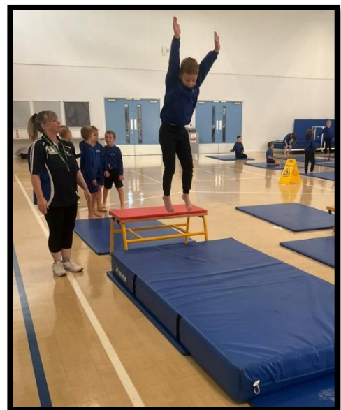
Year 3 have started their gymnastics sessions with Spitz Gymnastics – a fantastic opportunity to get the expertise of these coaches into our school.