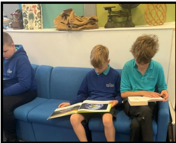
Year 5 have had, like many year groups, their first few library sessions of the year – exploring new books both fiction and non-fiction. We are well stocked in our library and children get to take them home.

Online training sessions will take place on Wednesdays 4 th , 11 th and 18 th June (7 - 9.30pm).