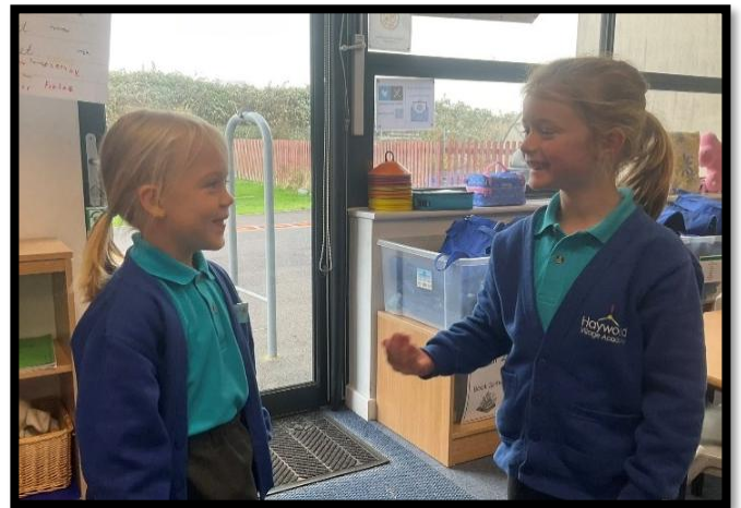
In PHSE this week, Year 2 were discussing and role-playing how we make friends.