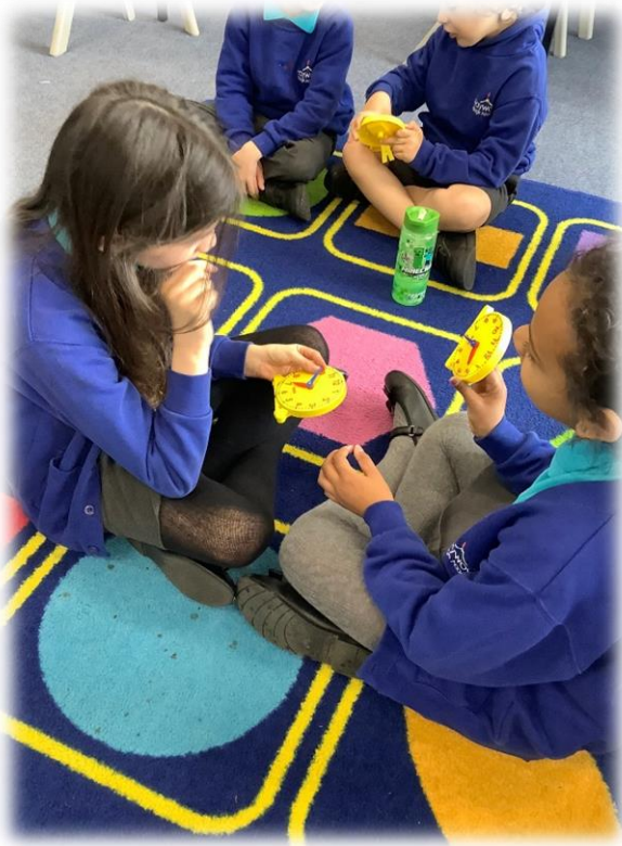
Year 2 have had fun-filled week which has included collage artwork, their first Gemini Gymnastic lessons and learning to tell the time.