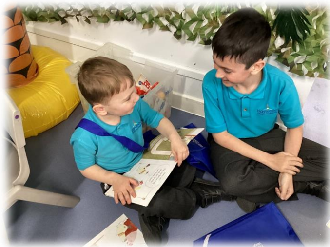
Reception children have seen their new outside area be developed, enjoyed learning to keep a steady pulse as musicians and enjoyed reading to their Year 6 buddies.