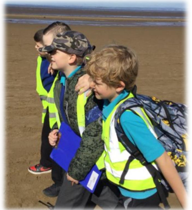
Year 4 visited Weston beach as part of their 'ignition' as they continue to be inspired by the story 'Renata's Seaside'.