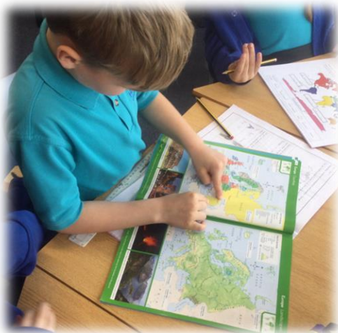
Year 3 geographers have been reading about Europe and they explored through mapwork.