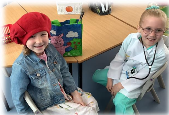
Year 1 have been reading the Bear and the Piano – a great story. They have been thinking about careers. These two were dressed ready to be an artist and a doctor.