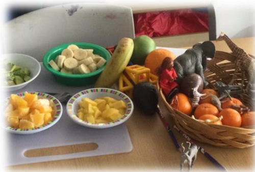
Pre-school have started reading Handa's Surprise, and also enjoyed trying all the fruits in the story.

The school website captures some of the learning from this past week: