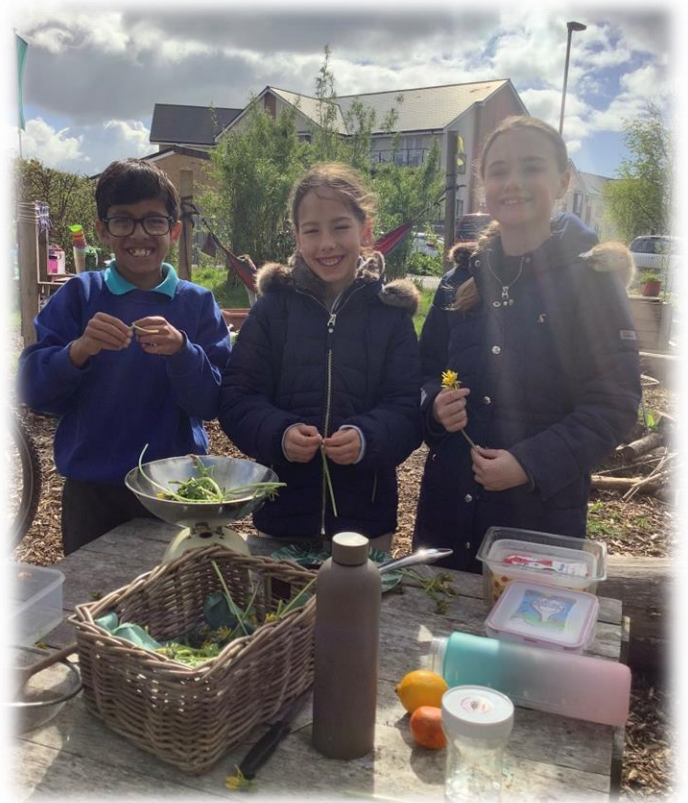
Year 5 enjoyed their first Forest School session of the term and were making dandelion jam – yum!