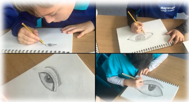
Year 5 artists have been learning how to develop their pencil drawing skills, with many drawing the eye with textured details.