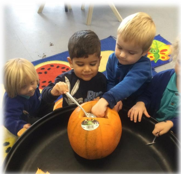
Pre-school Apple class were exploring what is inside a pumpkin – very sticky!