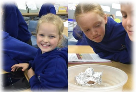
Year 4 have been learning how to conduct scientific experiments with states of matter!