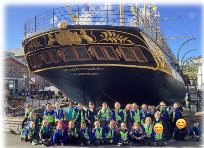
Year 2 geographers and historians visited the SS Great Britain. They enjoyed taking part in a workshop to find out more about Brunel and then had a tour of the ship.