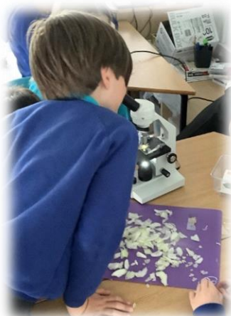
Year 6 scientists have been using their skills as scientists to explore slides under a microscope. They used their knowledge of cells to identify the nucleus and the cell membrane.