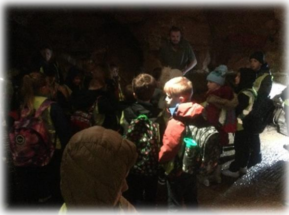
Hawthorn and Hornbeam classes visited Cheddar Gorge, linking their work on rocks as scientists with their exploration of human and physical features as geographers.

@HaywoodVillAc 01934 312720 info@hva.clf.uk