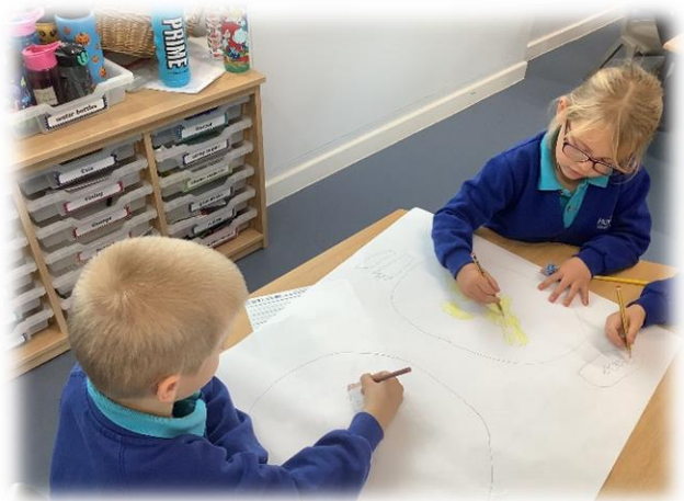
Year 1 busy creating their ideas for healthy meals as part of their science learning. They have also been writing instructions on how to make sandwiches.

You can look on the curriculum pages of the school website to see what the children have been learning this past few weeks.