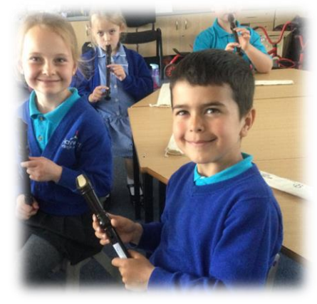
The recorders are back in action as are many other clubs this week.