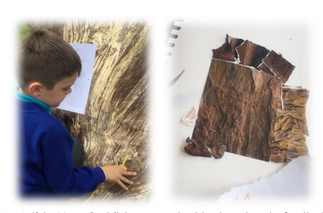
As Artists, Year 2 children created texture banks for their collage work, inspired by real life textures.