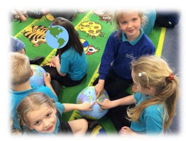
These Year 1 Geographers have the world in their hands!