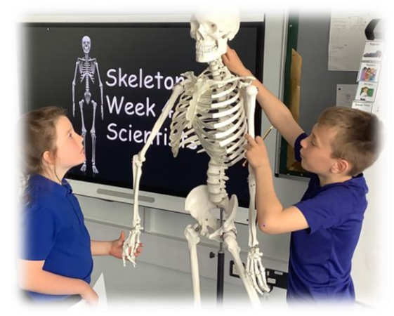
Year 4 Scientists have been learning about how bones move.