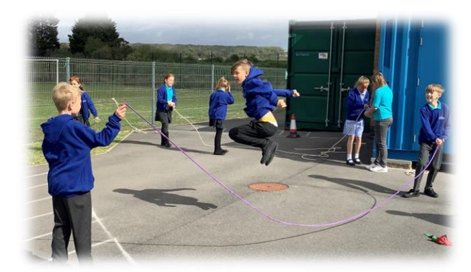
Year 4's are learning to write and be Scientists, but first they enjoy skipping!