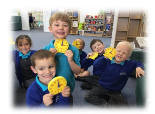
Reception children are learning to tell the time.