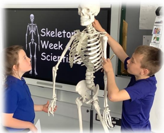
Year 4 Scientists have been learning about how bones move.