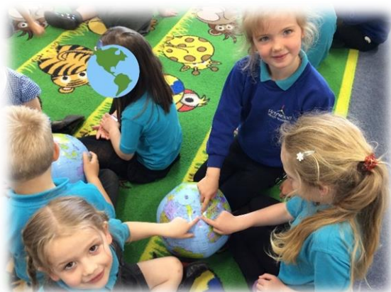
These Year 1 Geographers have the world in their hands!