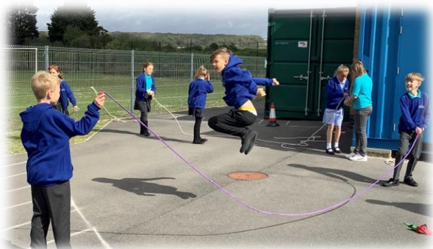
Year 4's are learning to write and be Scientists, but first they enjoy skipping!