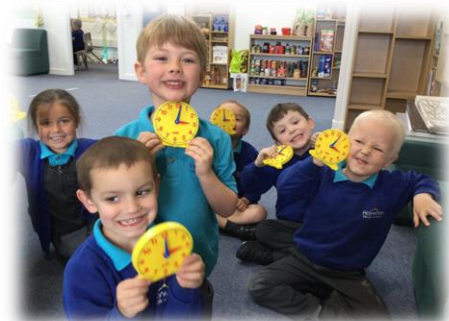
Reception children are learning to tell the time.