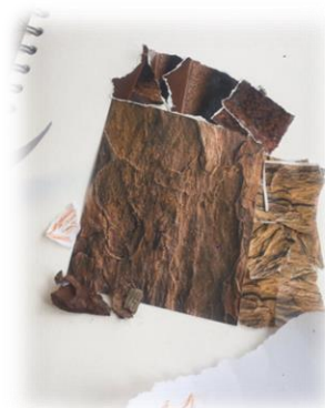
As Artists, Year 2 children created texture banks for their collage work, inspired by real life textures.