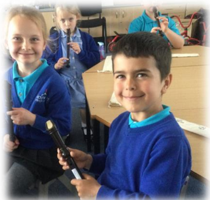
The recorders are back in action as are many other clubs this week.