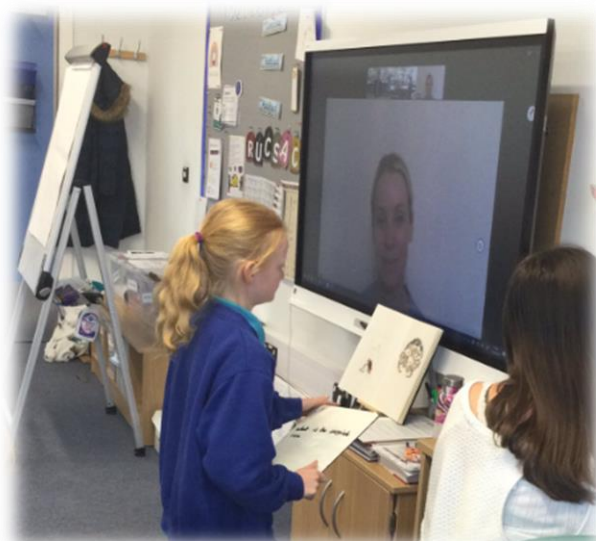
Year 4 scientists and writers interview a physiotherapist online as part of their enquiries on the human body.