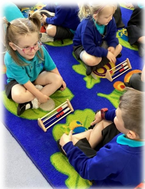
As mathematicians, Reception children are using rekenreks to make numbers.