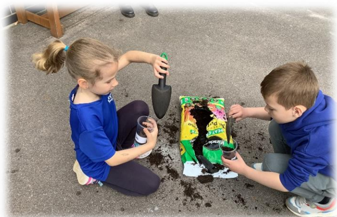
Year 1 scientists have been growing and planting their own seeds.