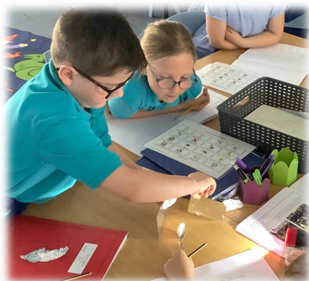
As scientists, Year 3 have been exploring light and how it travels.