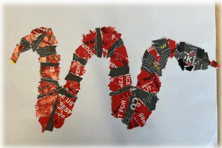
Year 6 artists have continued their fantastic collage work during their final revision and assessment week.