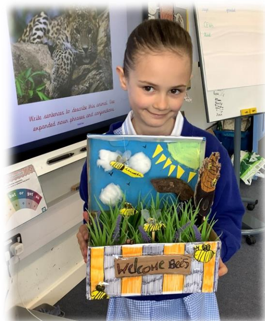
Year 2 have been creating amazing homework – habitats in a shoebox.