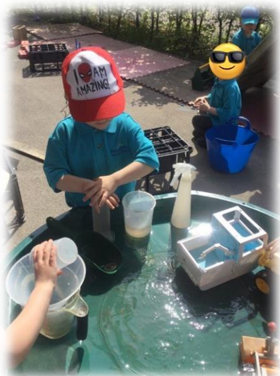
Pre-school having a great time in the sunshine! Thinking about capacity and ordering numbers.

The school website captures some of the learning from this past week: