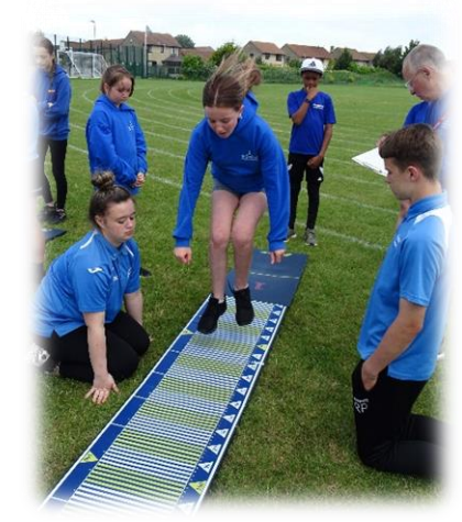
The children are getting ready for Sports Day. Year 6 are practising long jump.