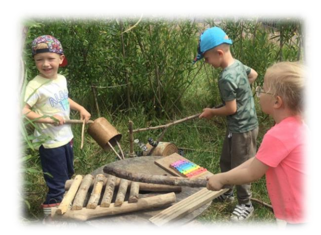
Reception children creating a band whilst in Forest School.

Please look at your child's class pages and their twitter photo/videos on the school website's curriculum pages.