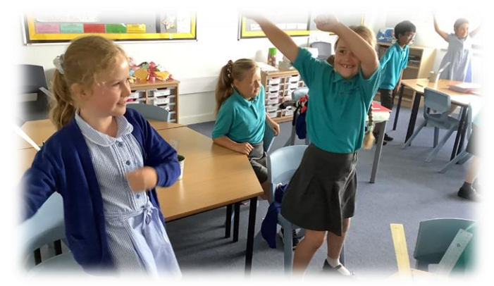
As historians, children have enjoyed learning about popular culture through music and how this has changed.