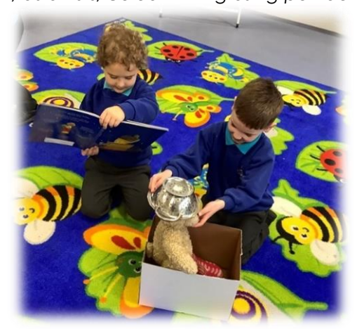
Reception children role-playing their new class story, 'Whatever next'

Year 5, as scientists, exploring forces in groups