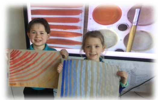
Year 2, as artists, colour mixing using powder paint

During our staff INSET our teaching teams revisited current research on 'how we learn' best and further invested time in applying theory to their teaching and learning. Our teaching teams will welcome your involvement in supporting how children learn by encouraging you talk about their learning and consider how to support the homework menu of opportunities, which are typically active and/or 'open ended'.