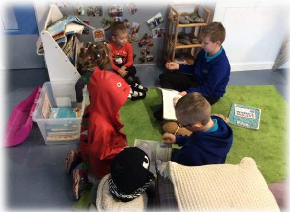
Year 5 reading to our Pre-school children

We will be changing reading books before Christmas. We certainly want children to have a break but reading a few times each week for 5 minutes will be helpful and no doubt enjoyable.