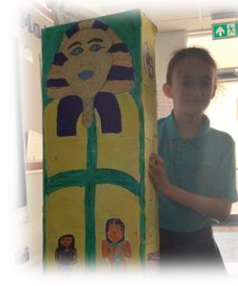
A sarcophagus model by Grace